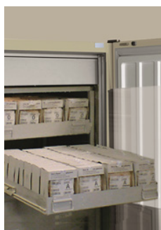
Custom made drawers upon request